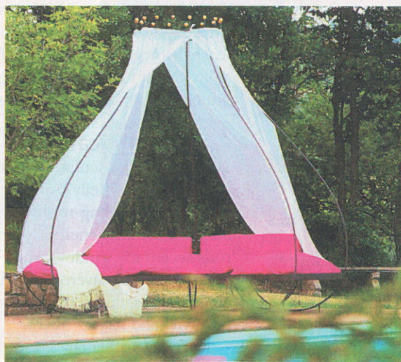
DAYDREAMER'S DELIGHT Add drama and dazzle with the Divano Ampolla from Caporali's outdoor collection.