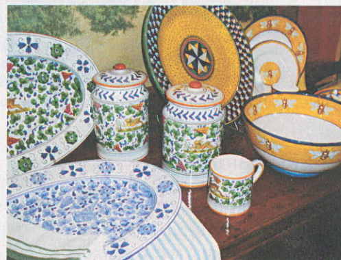
DELICIOUS DISHES U. Grazia's hand-painted Deruta ceramics make one-of-a-kind serving pieces that add color to the table.