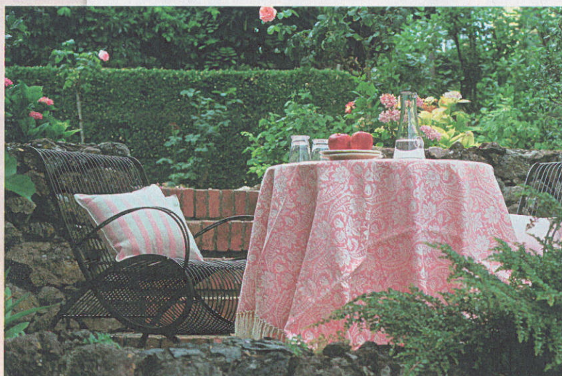
AN AFFAIR TO REMEMBER This tablecloth, made from Donna di Coppe fabric with added fringe, adds instant elegance to a sunroom or patio setting. Busatti, the manufacturer, also does custom work.